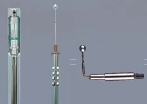
Expanded Seven Air Velocity Probe Line-up