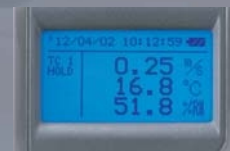
LCD display with bright backlight