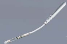
Telescopic, articulating probe