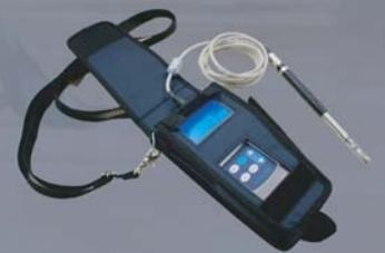
Hands-free Case now available!