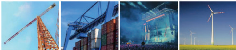
Cranes & Construction